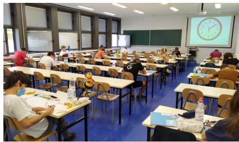
Tense moments in classrooms...

(algebra, combinatorics, geometry and number theory) were put to the test. We hope that the contestants enjoyed problem solving and will be ready to tackle tomorrow's problems at the team competition with same focus and determination.