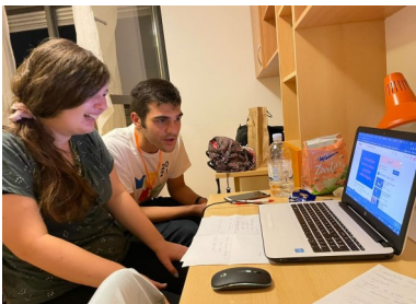
Guides in shock while translating the lyrics of Polish team's favourite song

Today we had a little chat with the Polish and Hungarian team! Here are a few excerpts: