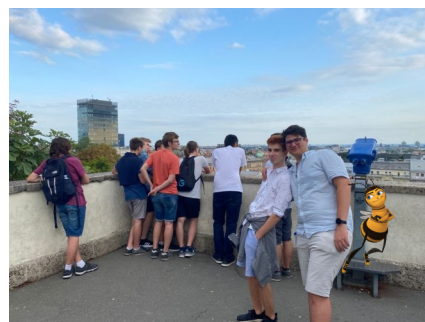
Treasure hunting again?

Just as yesterday, the teams had the opportunity to rest or to continue exploration of their surroundings. We'll let the photos speak for themselves.