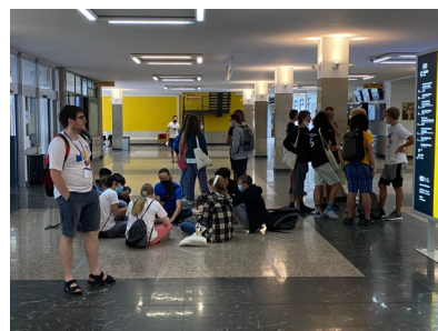
... and this certainly doesn't look tense... or does it?